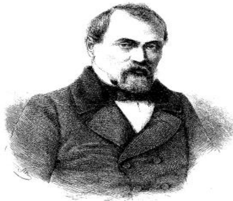
Franz Hermann Schulze-Delitzsch (1808-1883)

both well known personalities in the cooperative field, moved by the miserable condition of farmers and laborers, started making experiments with various methods of relief.