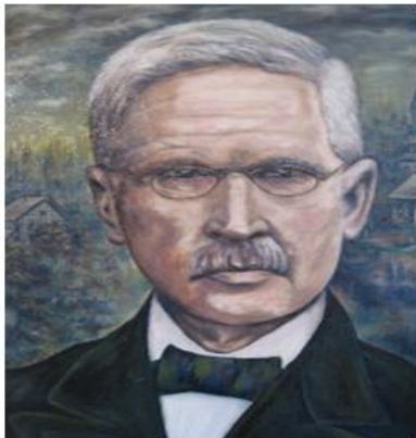
Friedrich Wilhelm Raiffeisen (1818-1888)

When such condition was around, two pioneers, Herr F.W.Raiffeisen and Herr Franz Schulze,